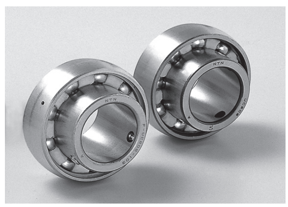
Bearings with solid grease for food machinery

Though solid grease protects a bearing against ingress of foreign matters (water, dust, etc.), it is not a sufficient means as a sealing device. Therefore, for applications that need reliable sealing performance, we recommend the use of contact type rubber seals (deep groove ball bearings, bearing units) or other seals (other bearing types).