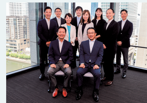
“NTN Report 2025” production team members

Going forward, we will continue to seek ways to improve this report and pursue increased corporate value through proactive communication with you. We sincerely appreciate your feedback and support.