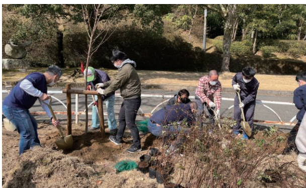
Tree-planting scene at Chubudai Sports Park (Mikumo Works)

As part of its environmental contribution to the local community, The NTN Group promotes environmental protection activities in mutual cooperation with the local community through various activities such as cleanups, weeding, and tree planting along roads, rivers, beaches, and parks around its business sites. Through our activities, we will continue to make further efforts to strengthen cooperation and build good relationships with surrounding residents and other interested parties.