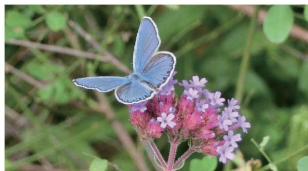
Male 3-voltinism imago perched on a verbenas flower.

Please refer to the website for details on "Environmental Protection." https://www.ntnglobal.com/en/csr/environment/protection.html